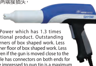
帕柯 Parker 展台号 Booth No.: 4.1E37-42

PARKER IONICS 装有带电量比一般产品高 1.3 倍的超脉冲冲击力, 箱体里面角部的循环非同寻常, 箱体里面底部粉末涂料堆积少, 喷枪近距离喷涂时, 粉末涂料飞溅量少, 喷枪电线两端接插头, 可简单交换, 喷枪先端的加载电压, 最大 100Kv (标准电极: 阴极)。 Mounted with Super Pulse Power which has 1.3 times of electric charge of conventional product. Outstanding penetration into the inside corners of box shaped work. Less powder accumulation on the inner floor of box shaped work. Less powder is blown away or lost even if the gun is moved close to the parts to be coated. The gun cable has connectors on both ends for one-touch replacement. Voltage impressed to gun tip is a maximum of 100Kv (standard polarity: negative).