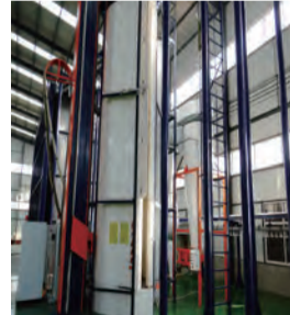
君禾 Joihey 展台号 Booth No.: 4.1E31-36

JOIHEY 君禾机电 采用不粘粉末的三明治工程塑料板制作喷房主体, 喷房内部呈圆柱形, 没有棱角位; 喷房配置自动清理装置, 在换色时, 自动清洁系统在升降机带动下, 从上而下清理喷房。 The spray booth is made of sandwich engineering plastic panel, which does not adhere to powder. The inside of the spray booth is cylindrical therefore there is no corner. The spray booth is equipped with an automatic cleaning equipment. Driven by a lift, the automatic cleaning system can move from up to down to clean up the booth when changing colors is required.