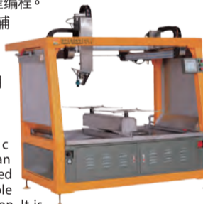
广伸 Guanson 展台号 Booth No.: 4.1E63

Guanson 全方位自动喷涂机采用德国 Festo 导轨, 持久耐用, 机身结构一体化, 高速运作更加平稳; 手摇轮脉动发生器, 便于精确, 快捷编程。 伺服马达精确控制, 辅助探针功能, 精度高、产品稳定; 机架体积小, 移动方便; 针对性喷涂专业强, 量产高, 更省漆, 高效率。采用机械手关节臂, 喷涂方位自由度扩大, 专门针对工件死角位置。 The Omni-Directional Automatic Spraying Machine equips with German Festo's durable guideway and integrated casting machine frame for more stable running effect at high speed operation. It is installed with a hand-round pulse generator for precise and convenient programming, as well as a servomotor control with auxiliary needle functions, ensuring high precision and steady quality. The machine is equipped with a robot compliant wrist system so that it can expand its spray ranges, including corners.