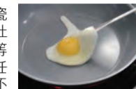
宜瓷龙 Excilon 展台号 Booth No.: 4.1G43-46

ECL excilon 可靠陶瓷涂层 宜瓷龙生产水性无机瓷膜涂料, 产品应用于灶头、炊具、蛋糕盘、烤瓷板、水泥板、太阳能等领域。用于炊具的陶瓷涂料, 健康安全, 无任何有机分解物质, 具有优异耐高温性和良好不沾性能; 用于分火器的陶瓷涂料具有优异耐冷热冲击性能和耐酸性能。 Excilon manufactures waterborne inorganic ceramic coatings. Its products are used for burner covers, cookers, cake pans, ceramic coated Al panels, calcium silicate boards and solar energy applications. Ceramic coatings for cookware application is good for health and safety, and it releases no organic decomposition but has excellent heat resistance and non-sticky performance. For burner covers, it has excellent heat and cold shock resistance, as well as acid resistance.