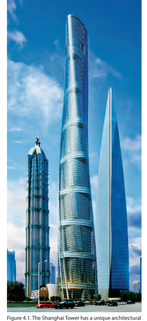
Figure 4.1. The Shangnal rower has a unique architectural style and significant height, especially compared to the surrounding buildings. 图 4.1 与周边建筑相比,上海中心大厦具有独特的建筑 风格与出众的高度

space and indoor story heights, and an all air VAV conditioning system. Since the indoor noise is required to be less than 45 decibels, noise elimination equipment is installed in the machine room and air blast ducts. By and large, the aforementioned measures still fail to meet the requirements of noise elimination. Thus, in the stage of equipment tendering, we put forward a highly rigorous test requirement for the noise of floor air handling units and air conditioning facilities. Also, we instated a more severe manufacturing requirement on the boundary dimensions of air conditioning units in order to also meet the needs for air conditioning room spaces.