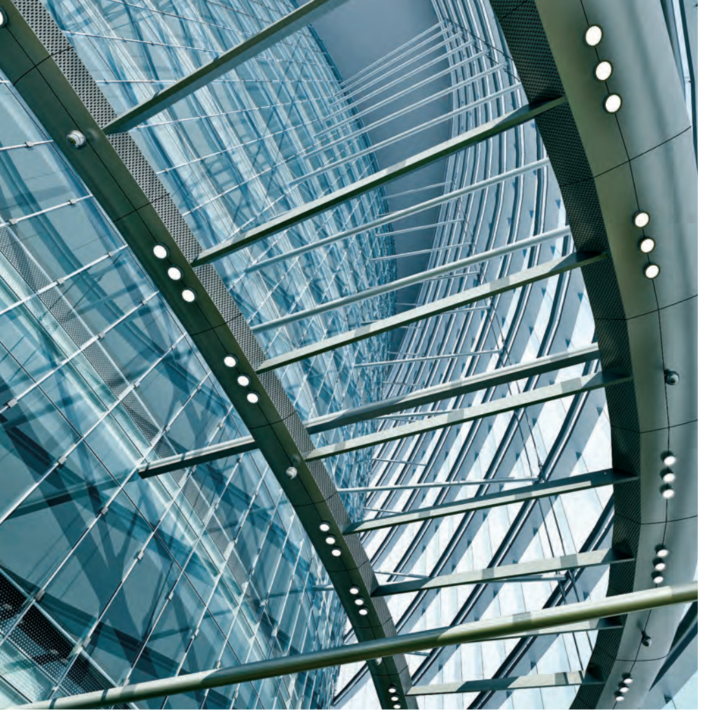
Figure 4.2. The Shanghai Tower building envelope 图 4.2. 上海中心大厦建筑表皮