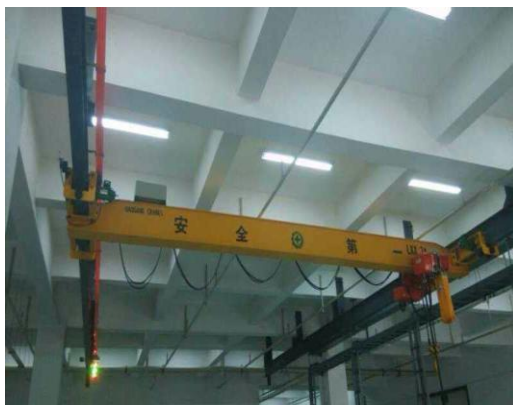
单梁悬挂起重机/Single suspension cranes