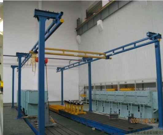
KBK 组合式起重机/KBK Cranes rail