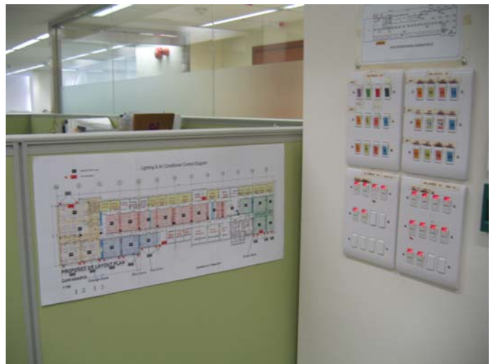
Lighting and AC zone map made by ITSC. Power switches have been labeled according to the map so colleagues can switch off lighting and AC in their working zones when they leave.

由 ITSC 製作的照明和空調區域圖。旁邊的燈和空調開關掣根據區域圖用不同顏色和編號標示，幫助同事離開時關掉自己工作區域的燈和空調。