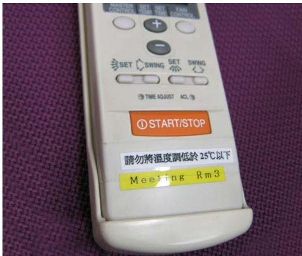
Homemade sticker on AC controller remind users not to set AC temperature below 25° C.