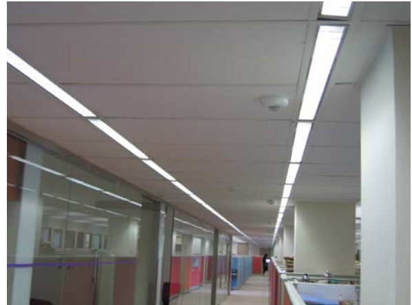
Motion sensors on the ceiling help switch off corridor lights automatically after office hours when no motion is detected.