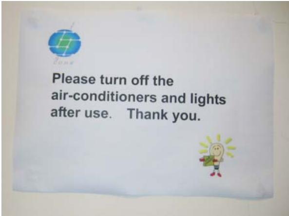
Signs made by ITSC that remind colleagues to conserve energy have been posted around the office.

A big thank you to the Information Technology Services Centre (ITSC) for sharing some of the energy-saving measures in their office! 感謝資訊科技服務處分享其辦公室中採取的一些節能措施！