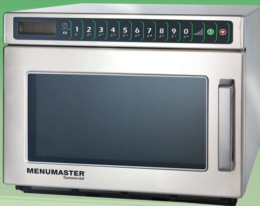
Model DEC18MC shown