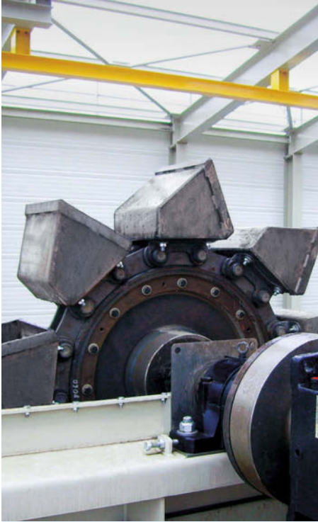
View of the central chain bucket elevator