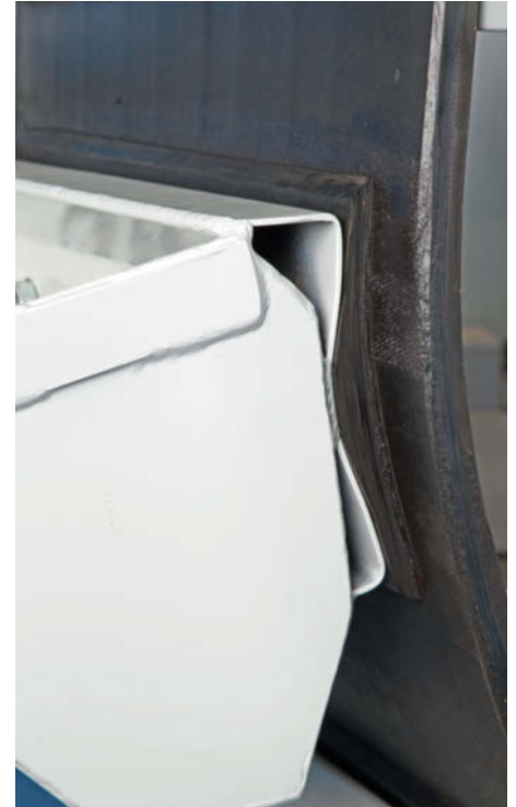
Optimised bucket design for minimum wear and long service life