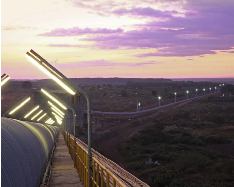
BEUMER troughed belt conveyor, Binh Phuoc, Vietnam