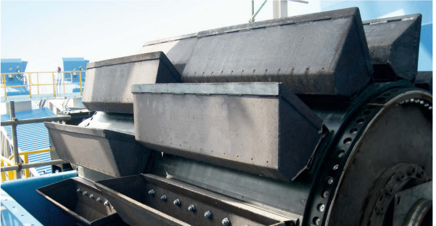
BEUMER heavy-duty belt bucket elevator, Tuas Power, Singapore

Heavy-duty systems are needed particularly when rocks and soil have to be transported. The BEUMER heavy-duty belt bucket elevators are perfectly suited for use in the cement and mining industries and in power stations.