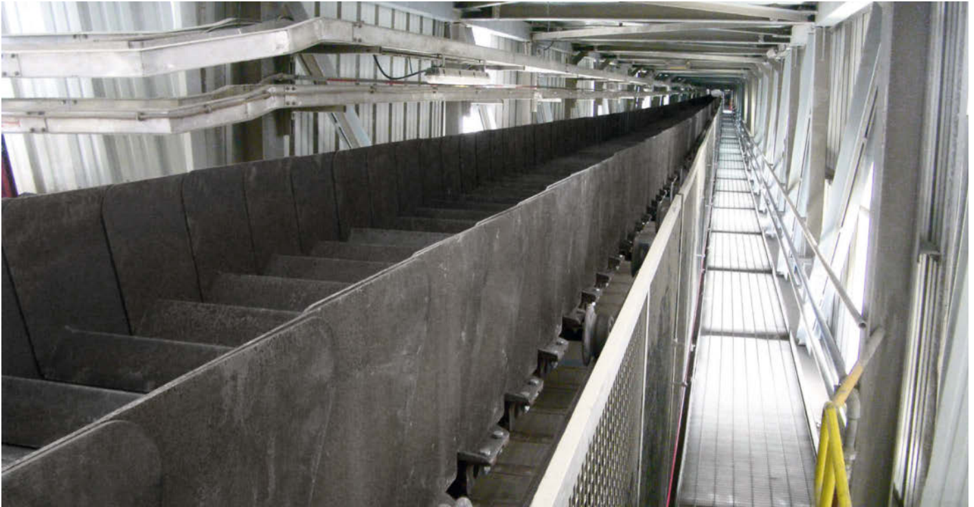
BEUMER bucket/belt conveyor