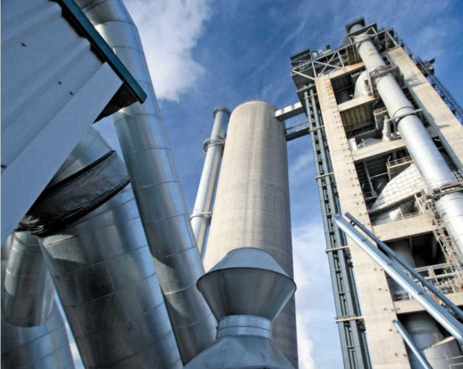
BEUMER high-capacity belt bucket elevators