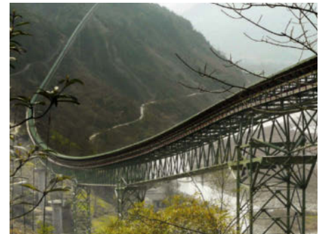
BEUMER troughed belt conveyor, Asia Cement Group, Sichuan, China

Trucks and trains rapidly reach their limits on difficult terrain or when transport volumes build up. The highly flexible BEUMER belt conveyors are a better means of transport in such cases – both from an environmental perspective, thanks to energy recovery systems and low CO 2 emissions, and economically, because of the low investment and operating costs involved.