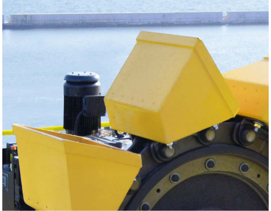
BEUMER central chain bucket elevator