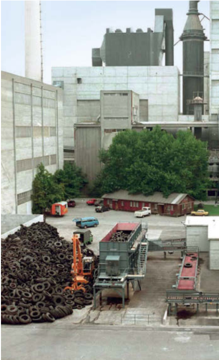
System technology for the transport of used tyres