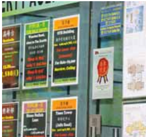
獲頒發「商舖嘉許獎章」的商舖可於有效期內，在有關的營業地點張貼該獎章標誌。

Under this CPD Mark Scheme, on 1 October each year, agency shops with 50% or more of their employed practitioners (amongst them must be the branch manager) having attained the CPD points target for their previous CPD period will be presented with the CPD Mark for Estate Agencies.