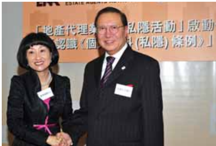
監管局副主席廖譚婉瓊女士與個人資料私隱專員吳斌先生出席地產代理業保障私隱活動啟動儀式。

In August 2008, the EAA in conjunction with the Office of the Privacy Commissioner for Personal Data kicked off a one-year educational programme aimed at deepening licensees' understanding of the legal requirements under the Personal Data (Privacy) Ordinance. The programme includes CPD seminars for individual estate agency firms and trade associations, and production of a handbook on privacy protection for the estate agency trade. As at 31 March 2009, 29 CPD seminars on privacy issues had been held and more than 1,300 licensees had participated in these seminars.