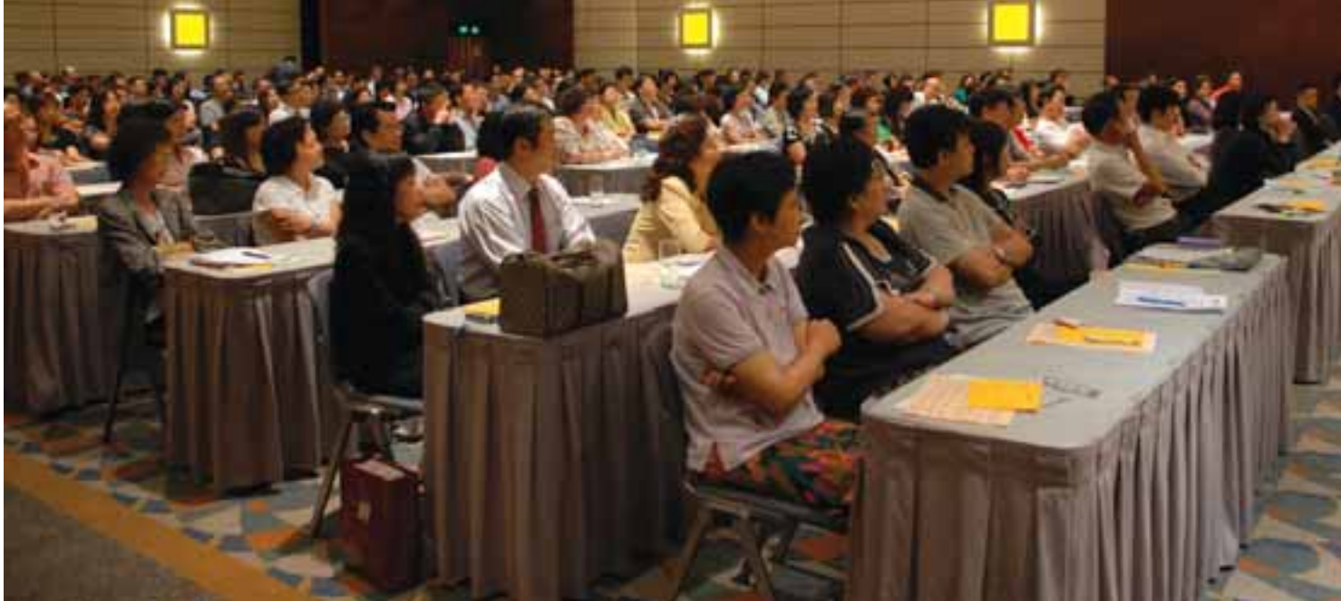
2008/09 年度，持續專業進修計劃的參與人次上升了 61%。 In 2008/09, the enrolment in CPD activities went up by 61%.

本年度，監管局持續專業進修計劃的參與人次大幅增加。該計劃在 2005 年以自願參與形式推出，藉著鼓勵地產代理從業員參加多元化的課程，提升從業員的專業能力，讓他們及時掌握最新的知識。