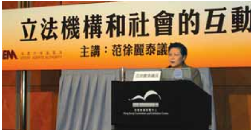
立法會主席范徐麗泰議員，GBM，GBS，JP，擔任專業領袖講座系列的主講嘉賓。 President of the Legislative Council the Honourable Mrs Rita Fan, GBM, GBS, JP, speaks in the Distinguished Speaker Series.